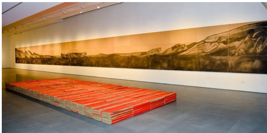
Figure 2. <Tea Alchemy>