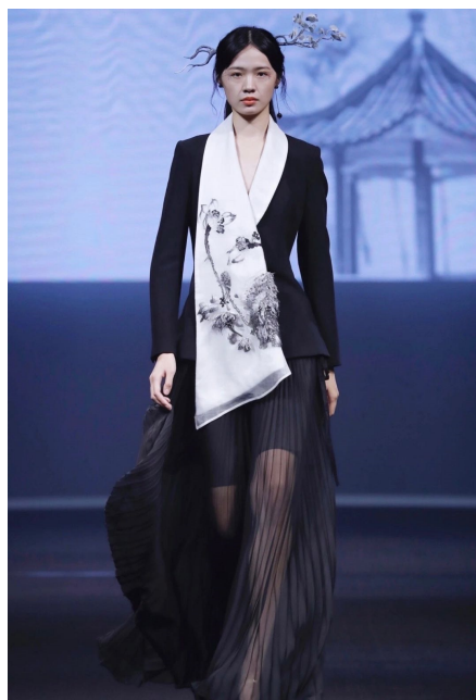
Figure 3. "Desert traveler" in 2018

embroidery technology, can not only show the magnificent traditional culture of our country, but also promote the unique oriental charm.