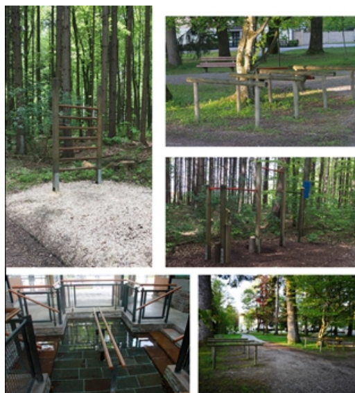
Figure 2. Fitness equipment such as single parallel bars next to the street green space

There are also a series of spa and sports and fitness facilities in the town (Figure 2). In addition to elbow baths, foot baths, branch baths and other spa facilities, there are more than 20 sports venues such as golf courses, sand courts, tennis courts, and gateball courts. Various fitness equipment, such as parallel bars, balance beams, etc., are often found in the green spaces on the streets of small towns and beside slow-moving roads. People can use them by themselves.