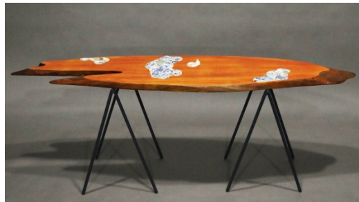
Figure 1. "Landscape Stream", the author's self-photo

Landscape Stream Furniture is a work made during the training when participating in the National Art Fund Design Furniture Talent Project in 2018. Based on the history of the development of ancient Chinese outdoor furniture, the furniture creation on the basis of combing and learning the skills of traditional Chinese outdoor furniture has created "Landscape Stream" (Figure 1).