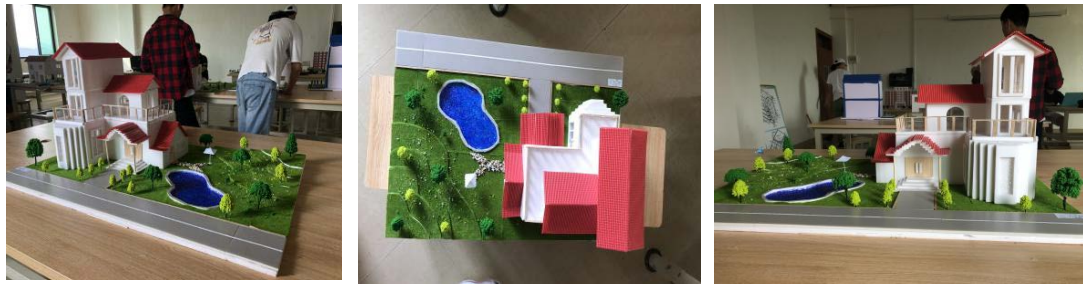
Fig 4 Side elevation, top view and front elevation of solid building model