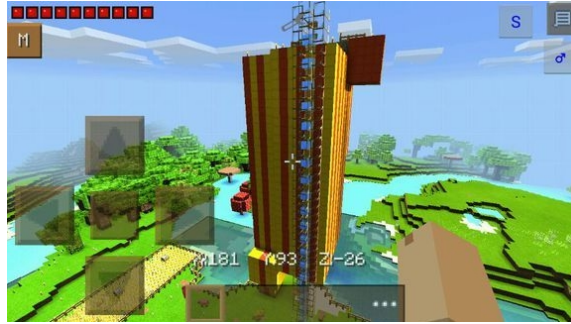
Fig 1 The game of Minecraft in mobile phones

In the creation mode, there are many kinds of materials, such as the ground materials including land, grassland and floor tiles; the wall materials made of stone, brick, and wood; the scenery with glass, guardrail, water, flowers and trees. Students can make full use of their imagination and use these materials to easily build architectural works of different styles. It plays a certain role in the accuracy, aesthetics and coordination of the later man-made architectural model.