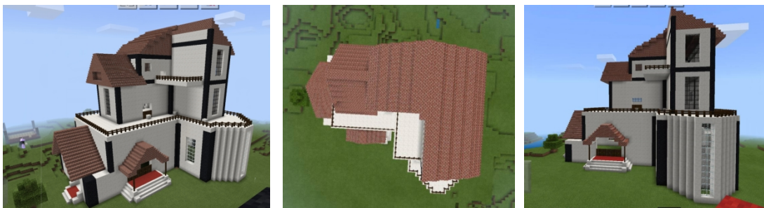
Fig 3 Side elevation, top view and front elevation of virtual architecture in the game of Minecraft

In the process of making a model, a group of 2-3 students work together to complete the model in a mobile game. In the game, students exercise their creative skills of hand and brain, the cooperation ability of group members, and the allocation and management ability of each group leader.